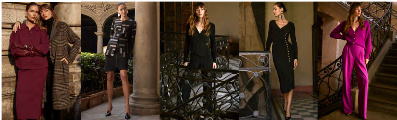
COVER 253962 243967F25 253963 | 253039 | 253946 P4 253929 253036 P5 253046 P6-7 253140 253147 P8 253906 253296